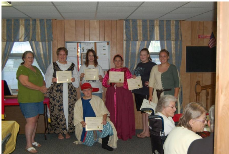
Good work rewarded

It was a great success! The feasters loved the food and everyone had a great time!