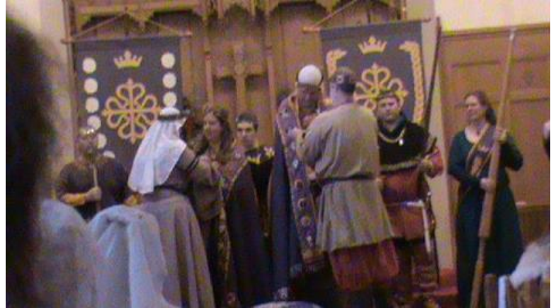
Beginning of the end of the Reign