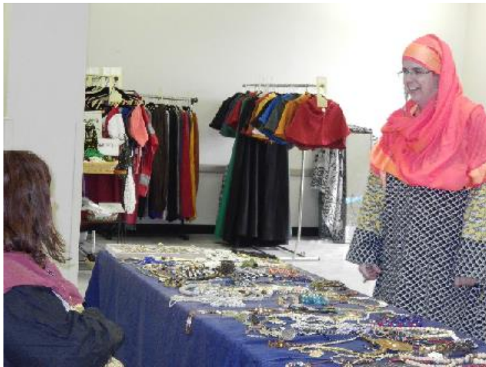
Photo by Cathy Glueck (SKA Lady Catin of Edington) ©2014Used with permission.

Image ©2014 Lucy E. Zahnle. Used with permission.