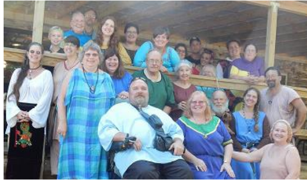
Image ©2014 Cathy Glueck. (SKA Lady Catin of Edington) Used with permission.