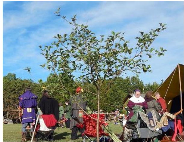
Image ©2014 How Patton. (SKA Howard of Brockenhurst) Used with permission.

A Tree Grows at Autumn Arrows [It should grieve you how close I come to immortality]