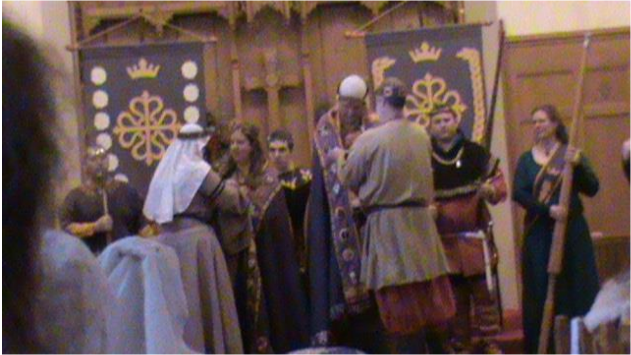
Beginning of the end of the reign ...