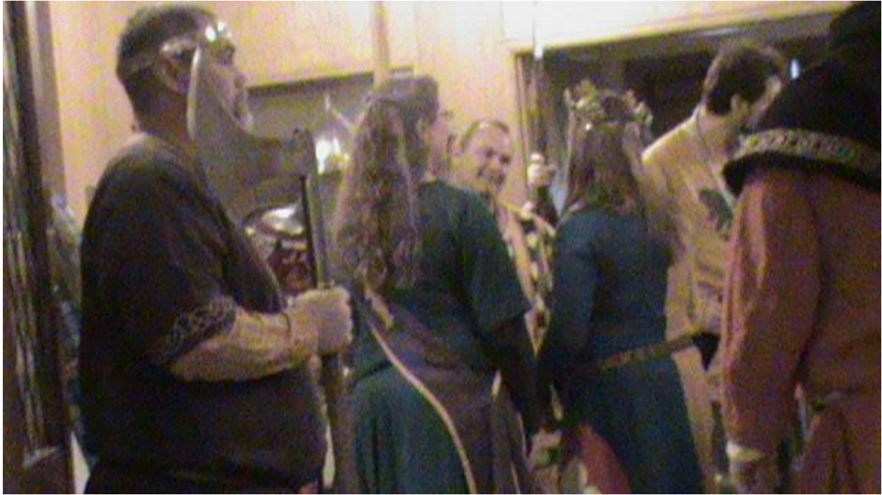
Royal Milling ...