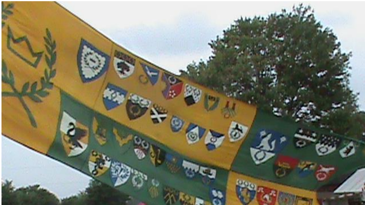
"Pennsic Banner, 2012"