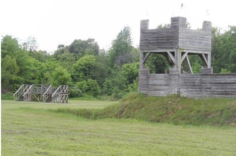
View of the fort from the door of our tent.

There will be another great opportunity for all of us to attend an event at this site in October as the B3R/Gray Niche War is being held there on the last weekend (Oct. 23-25). We might recommend a less scenic route than we took as Hwy. 160 out of West Plains was long, slow, and very, very snaky!