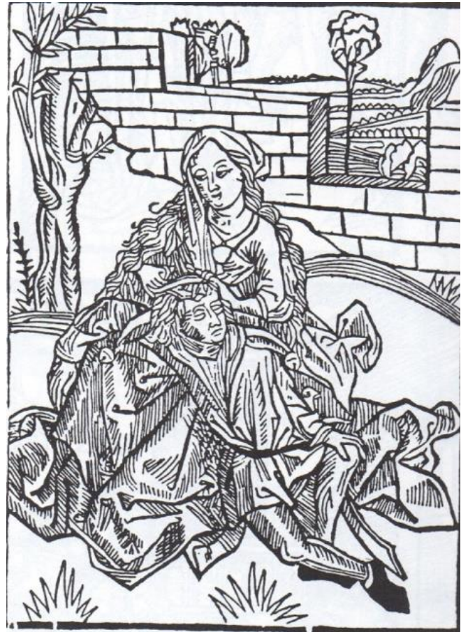
Image in public domain. Taken from Medieval Life Illustrations . Publisher: Dover. Permission to use freely granted on the copyright page in the book. Used with permission

My rose a petal dropest day by day As ocean waves do wear away the sand And lovers' kisses bits of soul demand. The Lord of Time doth steal my rose away, And what is left grows brittle on the stem, Its beauty waning through the hours of strife, And joy and sun and rain that make a life. Yet brittle petals worth still have in them, For scarlet, faded, ghosts a vibrant shade, And scent recalls the joy of summers past When thou and I didst stroll in Venus' glade And didst our petals mix in rampant heat, Or sort them by the fire in cooler times To dwell upon when petals fall less sweet.