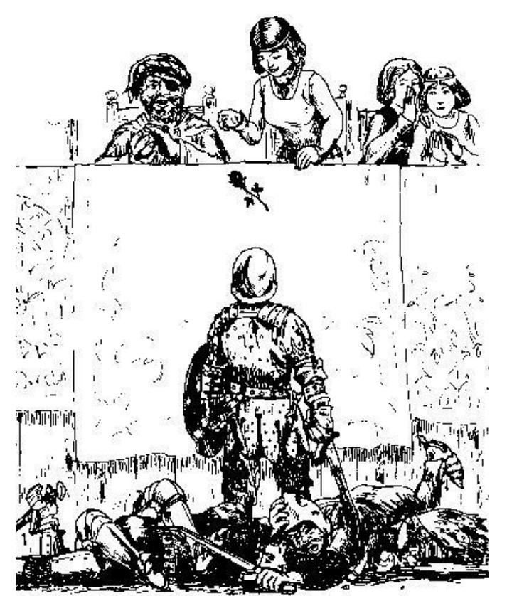
Art by HL Paul Adler © 2011 Vincent D. Zahnle. Used with permission.