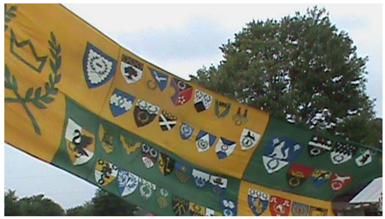
"Pennsic Banner, 2012" Image © Lucy E. Zahnle. Used with permission.