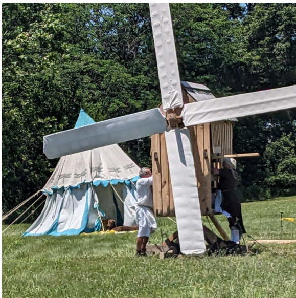
The Barony of Three Rivers' working windmill was another highlight of this year's Lilies War.